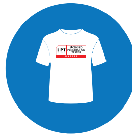
EC-Council LPT (Master) T-shirt